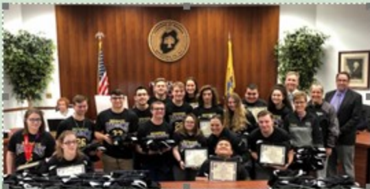
MTHS Unified High School Basketball Team celebrated at April 2 Township Council meeting for their NJSIAA Group B Unified Basketball State Champion title