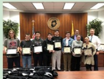
Monroe Township Boys Bowling Team honored as Central Jersey Group 4 Sectional State Champions

Congratulations to all our students on their outstanding accomplishments!